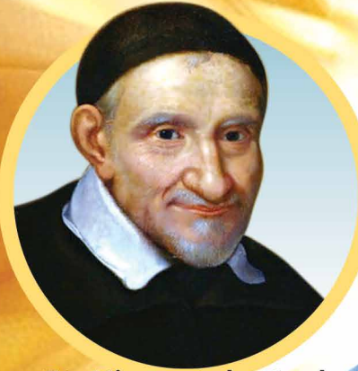
St. Vincent de Paul

OFFICE: Ozanam Karunya Bhavan (Old Age Home) Azhakulam Junction, Vizhinjam P.O., Trivandrum - 695 521 Ph: 0471-2484210